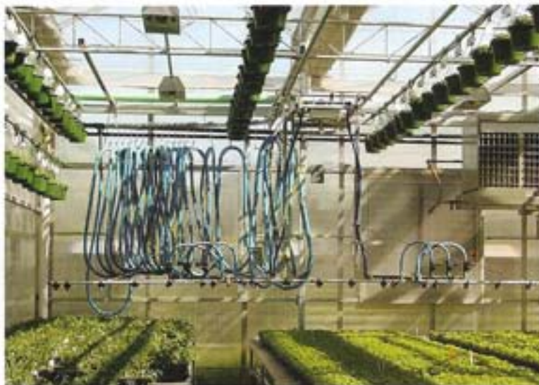
GTI ST Double Rail Boom