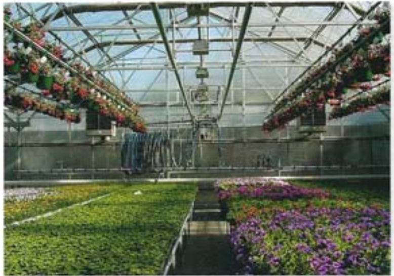
GTI HD Double Rail Boom