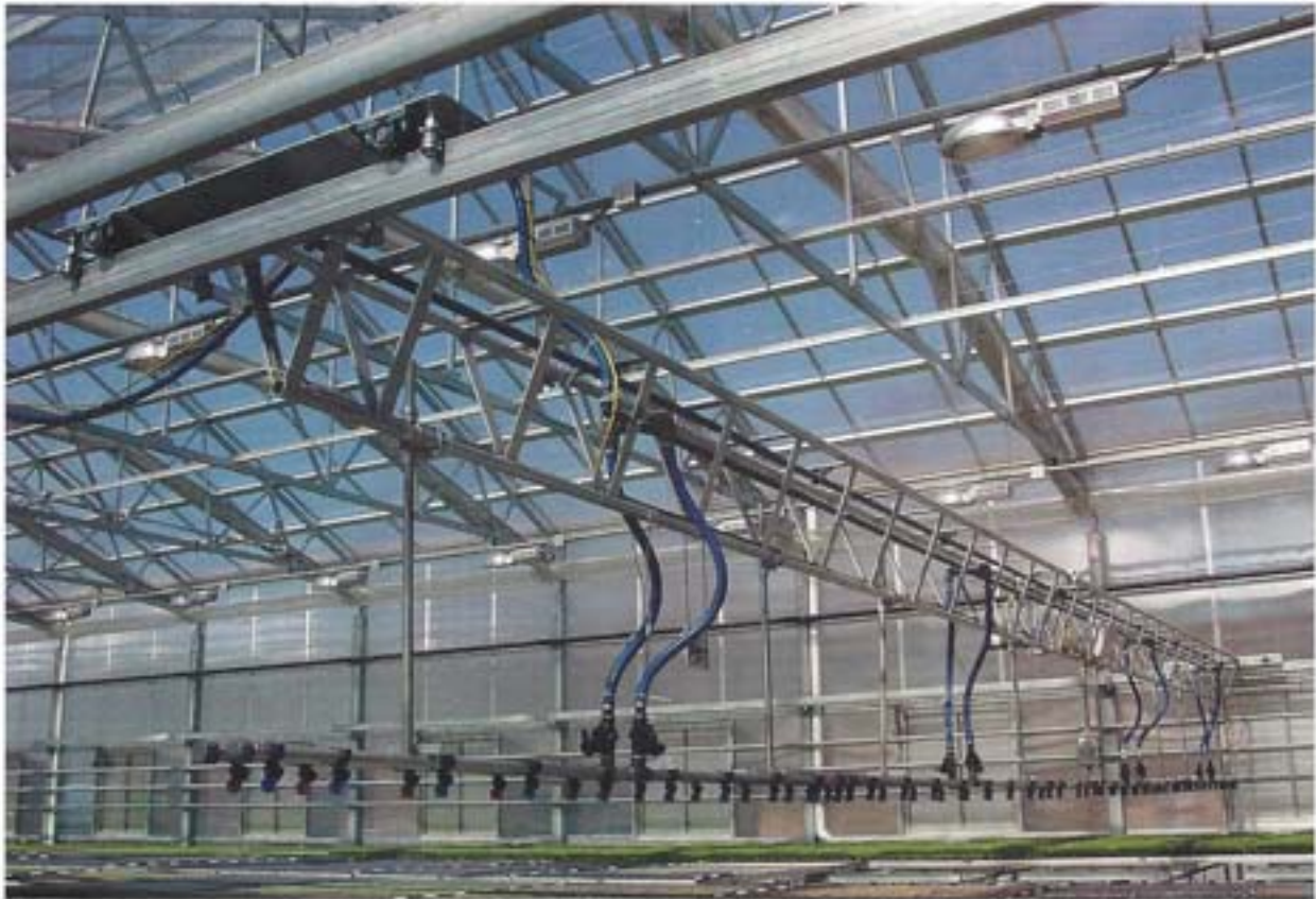
GTI HD Truss Boom

GTI LT and HD Truss Booms are the toughest and most versatile booms we offer. There are (2) models to choose from. You can choose the Truss Boom that is right for your greenhouse size and the purpose the boom is intended.