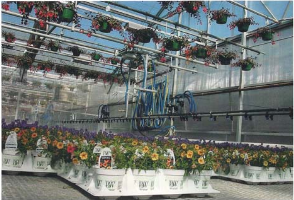
GTI HD Double Rail Boom

The GTI HD and EX Double Rail Boom models are the toughest double rail booms we offer. These booms are designed for larger greenhouses and also for high usage propagation and plug production applications. With maximum bay sizes of 50' X 600' 1 boom can water up to 3/4 of an acre of greenhouse.