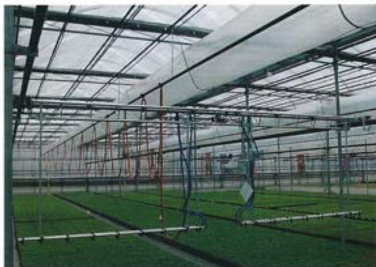
GTI LT Truss Boom