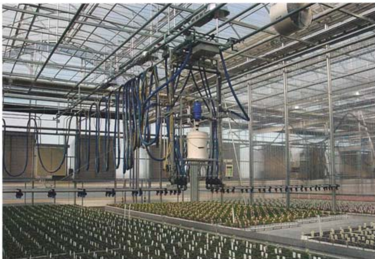
GTI ST Double Rail Boom

The GTI LT and ST Double Rail Boom models are the most cost effective double rail booms we offer. These booms are designed for smaller greenhouses. With maximum bay sizes of up to 36' X 300' 1 boom can water up to 1/4 of an acre of greenhouse.