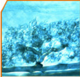
FIG. 2 DETAIL OF ARBUSCULES (LITTLE TREES)

Many endomycorrhizae form structures between and within the cortex cells of plant roots. Hyphal branches penetrate the host cell and give rise to small structures called “arbuscules” (Latin for tree). These structures resemble tiny trees and serve as exchange sites within cortical cells of plant roots. Arbuscules form within 2 to 3 days after the cell is colonized and will last from 1 to 3 weeks.